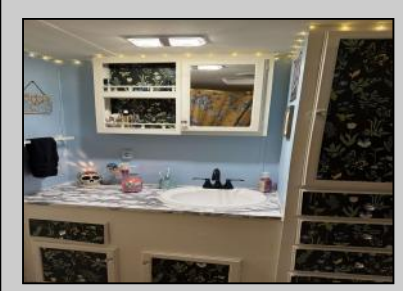
443 6th Ave Galloway Township, NJ 08205