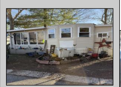
443 6th Ave Galloway Township, NJ 08205