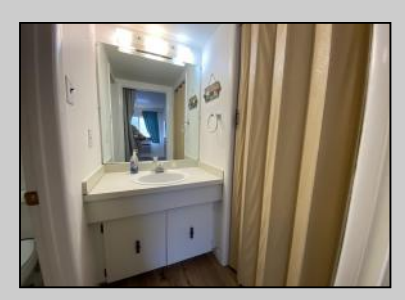
9105 Atlantic Margate, NJ 08402