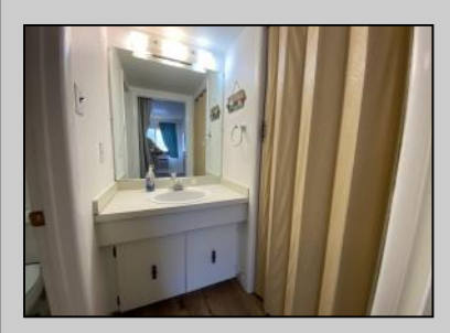
9105 Atlantic Margate, NJ 08402