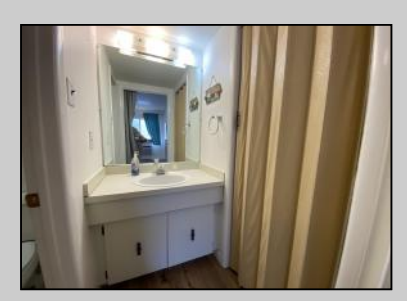
9105 Atlantic Margate, NJ 08402