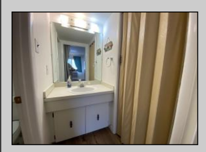
9105 Atlantic Margate, NJ 08402