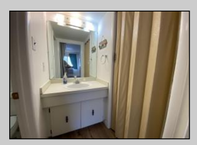
9105 Atlantic Margate, NJ 08402