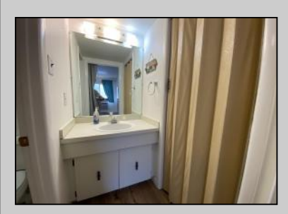
9105 Atlantic Margate, NJ 08402