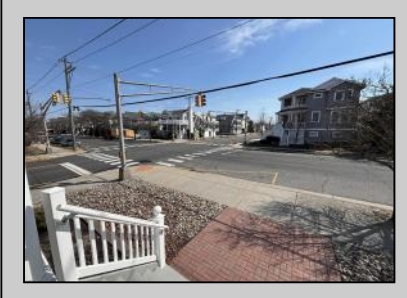
1400 Central Ocean City, NJ 08226