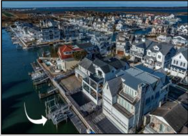
7 Barbados Ocean City, NJ 08226