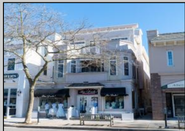
925 Asbury Ocean City, NJ 08226