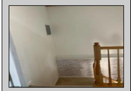
136 Pine Knoll Cir Mays Landing, NJ 08330