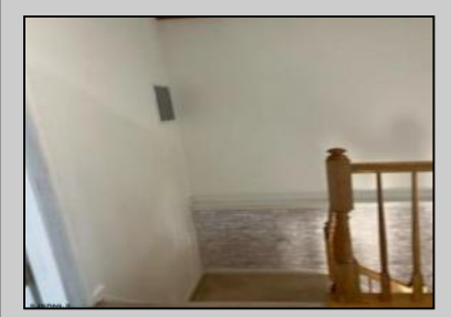
136 Pine Knoll Cir Mays Landing, NJ 08330