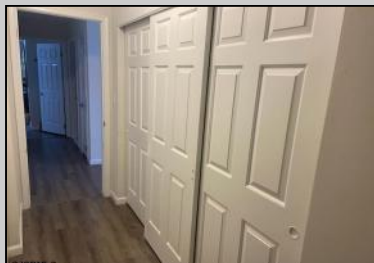
100 Deerfield Dr Manahawkin, NJ 08050