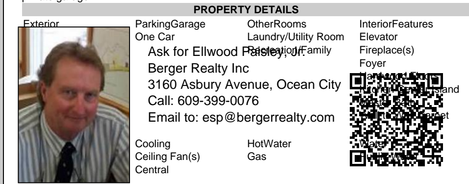
Sewer Public Sewer

PRICE REDUCTION! Easy to Show. Beautifully Furnished Home w/ Elevator on an Oversized 60 x 105 ft Lot featuring 5 Spacious Bedrooms and 4 1/2 baths in a Very Convenient Location close to Beach, Boardwalk, and Shops. The residence has Multiple Outdoor Spaces, including a covered front porch with pavers, a side-covered balcony, large back deck accessed from 2 of the bedrooms. and a completely fenced-in large side yard. 10 ft ceilings and handcrafted trim & moldings throughout the home. All New Window shutters and shades throughout the home including a new custom front door treatment. All Andersen windows and sliders. Spacious, wide open-concept LR w/ gas fpl, spacious dining room with many gorgeous windows with an abundance of light. Kitchen with granite and SS appliances, an abundance of cabinetry, and a large island. Beautiful hardwood flooring. King-sized MBR w/ gas fpl, double walk-in closets, and access to rear deck. Gorgeous new, white Master bath with extra large shower, double sinks & vanity, and large double linen closets. 4 additional spacious bedrooms- one with en-suite full bath and shower. Hall bath with double sinks and linen closet. Laundry room with utility sink, washer, dryer & cabinetry. All new Comfort Height Toilets (5). New heating system 2025. Ground floor with Private Cabana Room and full bathroom. 3-panel atrium door leading out to a paver patio & pergola. Spacious fully fenced-in side yard. The cabana room leads directly into the private garage.