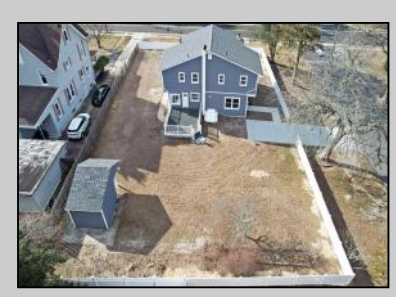
1804 Shore Rd Linwood, NJ 08221