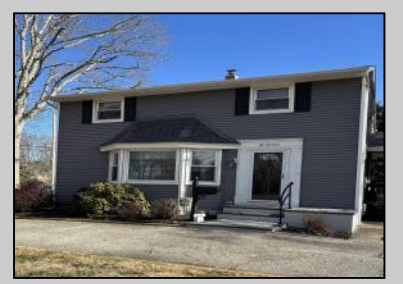
214 Barr Linwood, NJ 08221