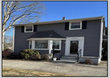
214 Barr Linwood, NJ 08221