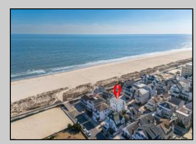
111 Avolyn Ventnor, NJ 08406