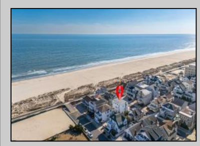
111 Avolyn Ventnor, NJ 08406