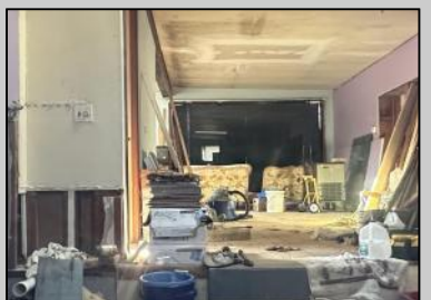
5 Lida Egg Harbor Township, NJ 08234