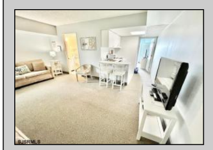
812-20 Ocean Ave. Ocean City, NJ 08226