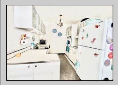
101 Plaza Place Atlantic City, NJ 08401