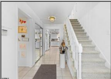
7905 Lagoon Margate, NJ 08402