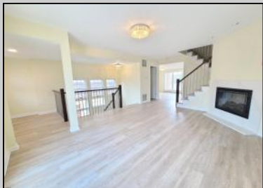
6315 Villa Ventnor, NJ 08406