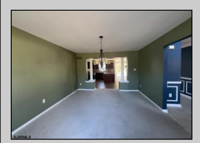
127 Ruby Drive Egg Harbor Township, NJ 08234