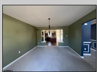
127 Ruby Drive Egg Harbor Township, NJ 08234