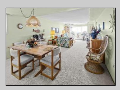
1900 Boardwalk North Wildwood, NJ 08260