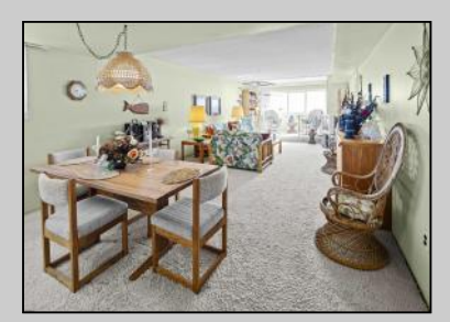
1900 Boardwalk North Wildwood, NJ 08260