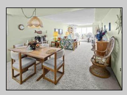
1900 Boardwalk North Wildwood, NJ 08260