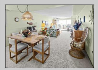
1900 Boardwalk North Wildwood, NJ 08260