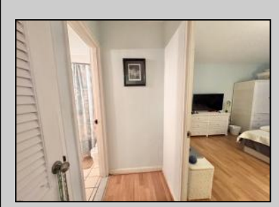
3817 Ventnor Atlantic City, NJ 08401