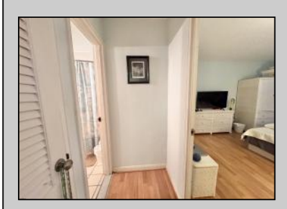
3817 Ventnor Atlantic City, NJ 08401