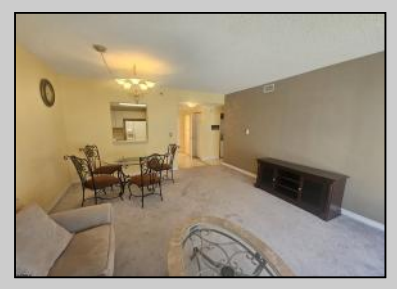
3101 Boardwalk Atlantic City, NJ 08401