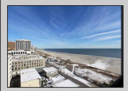
3851 Boardwalk Atlantic City, NJ 08401