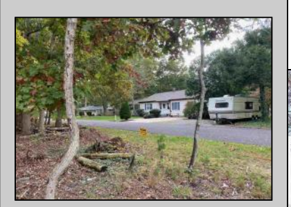
502 Holly Galloway Township, NJ 08205