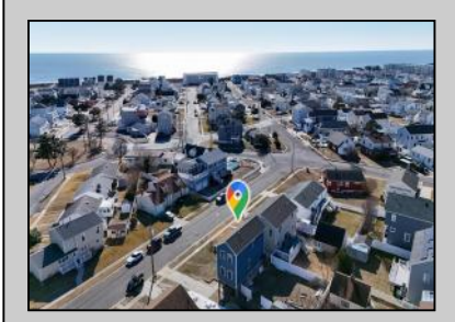
6 Sheridan Brigantine, NJ 08203