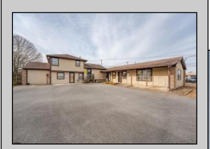
98 New Somers Point, NJ 08244