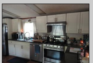
443 6th Galloway Township, NJ 08215