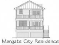
Margate City Residence

Addition/ Alterations to: 202 N Fredericksburg Ave Margate City, NJ 08402