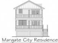
Margate City Residence

Addition/ Alterations to: 202 N Fredericksburg Ave Margate City, NJ 08402