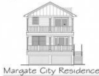
Margate City Residence

Addition/ Alterations to: 202 N Fredericksburg Ave Margate City, NJ 08402