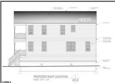
PROPOSED RIGHT ELEVATION SCALE: 1/4" = 1'-0"