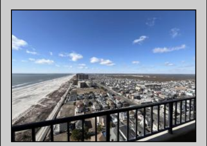
3851 Boardwalk Atlantic City, NJ 08401