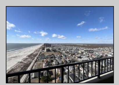
3851 Boardwalk Atlantic City, NJ 08401