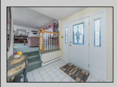
507 Douglas Ave Margate, NJ 08402