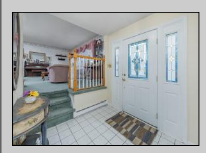
507 Douglas Ave Margate, NJ 08402