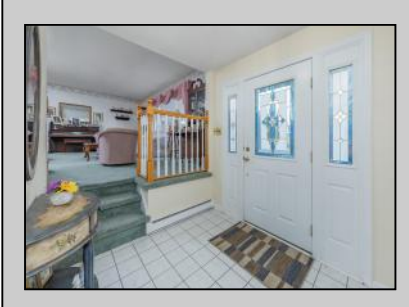
507 Douglas Ave Margate, NJ 08402