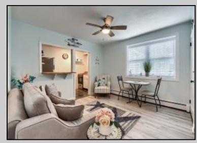
3401 Ocean Brigantine, NJ 08203