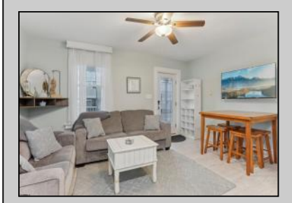
4315 Landis Sea Isle City, NJ 08243