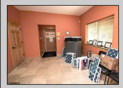
5116 Oakwood Mays Landing, NJ 08330